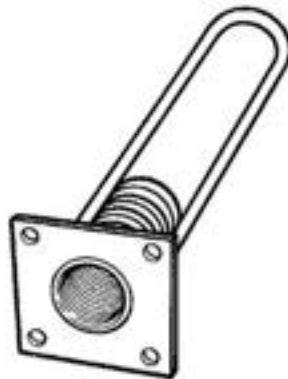
Insert with Optional Mounting Washer.